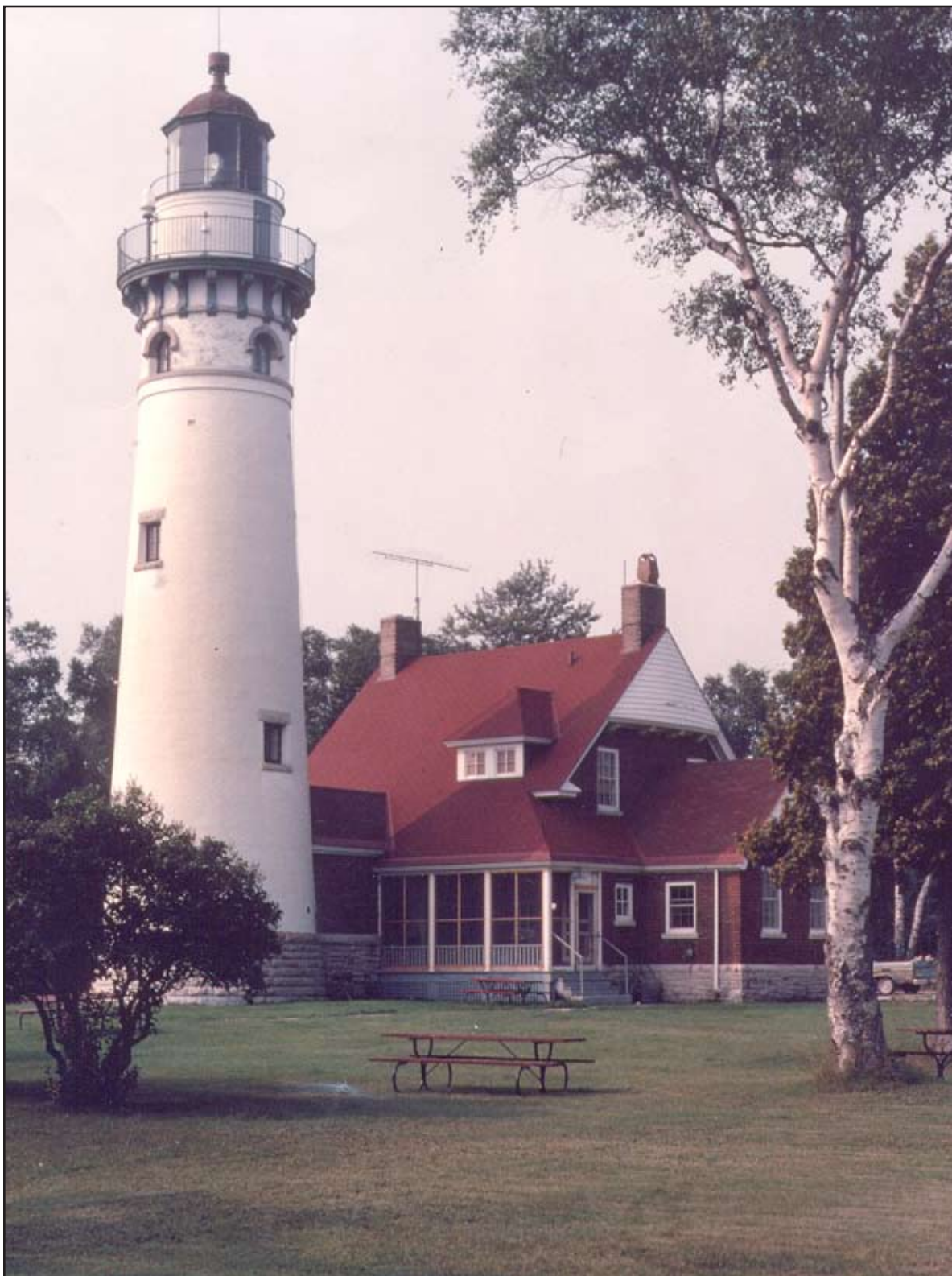
Seul Choix Pointe Light Station.