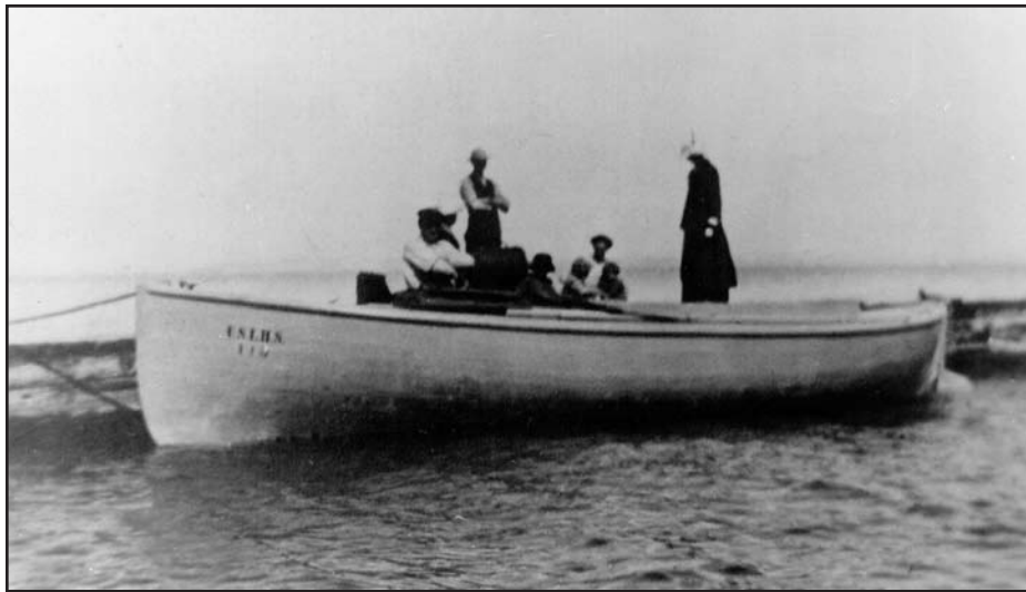
Typical turn of the 20th century, powered launch for a Great Lakes light station.