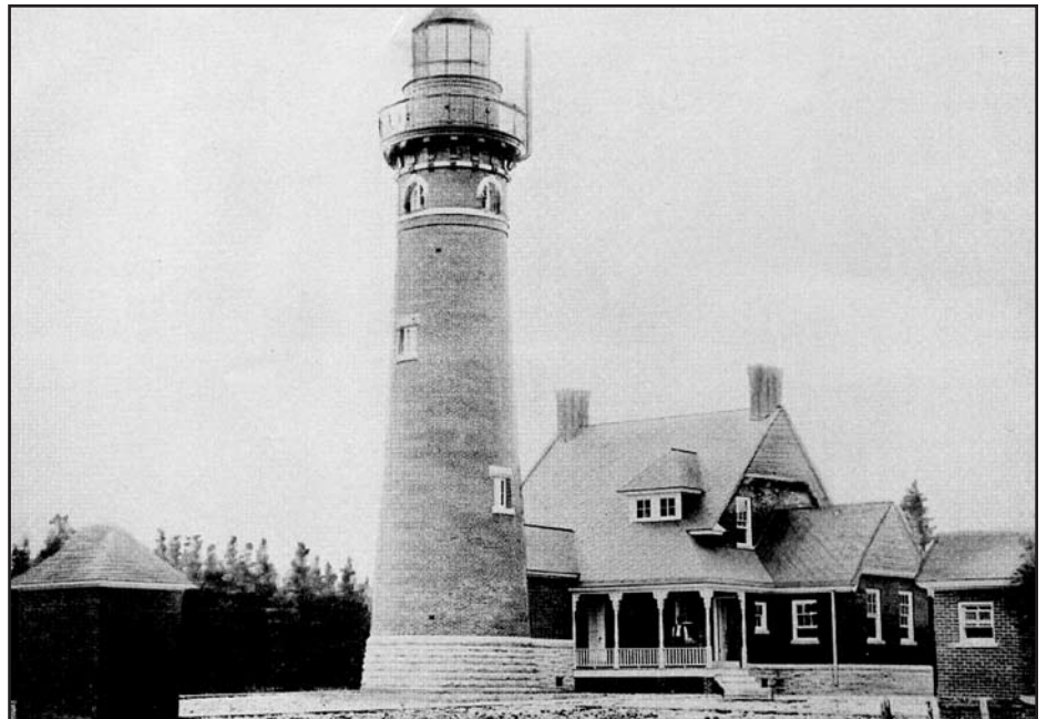
Seul Choix Pointe Light Station shortly after construction, prior to the tower being painted.

May 4, 1921 – Tender Sumac delivered 20 tons of soft coal and 65 cases of mineral oil.