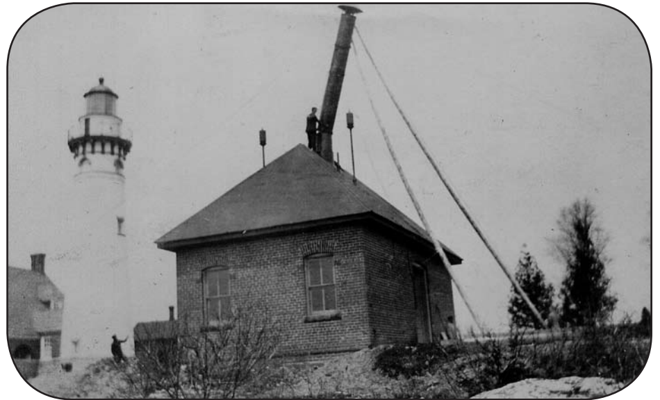
Above – Working on the chimney of the Seul Choix fog signal building. Note the two whistle fog signals on either side of the chimney. Below – Workers install a boiler for a steam-powered fog signal.