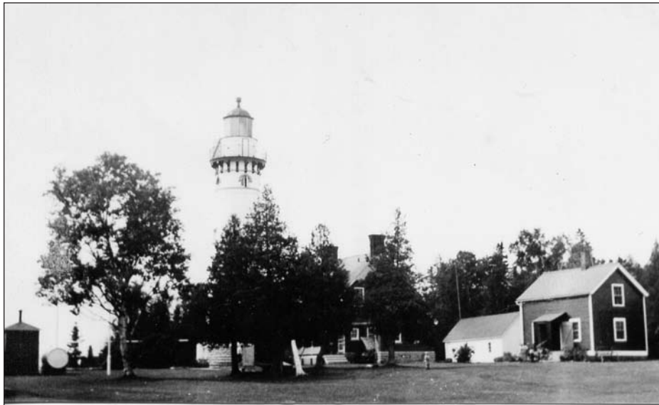
The Seul Choix Pointe station showing the 1st Assistant Keeper’s dwelling at right. The dwelling was modified from the original stable. Eventually the structure was sold and relocated to another property. The white structure next to the dwelling is the boathouse.

For more information check out Terry Pepper’s excellent website at: www.terrypepper.com/lights/michigan/seulchoix/seulchoix.htm .